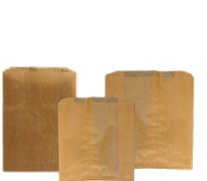
Kraft Liner Bags KL/KL1000, HS-6141, 6802W