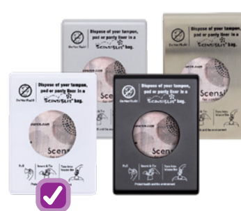
Scensibles® Personal Disposal Bag Dispensers SDW, SDSC, SDBL, SDSS