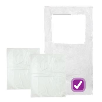
Scensibles® Poly Liner Bags LBS500HD, LBM500HD, LBSF500HD